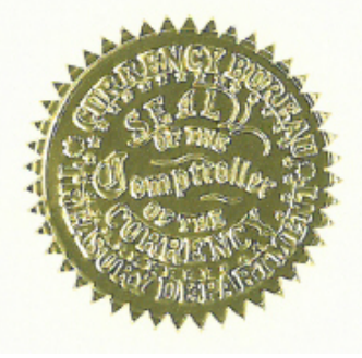
Comptroller of the Currency